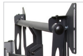
Patented Griplates™ hold the display tight on its mounting brackets