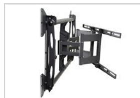
AM175 offers flat-panel displays 10° of tilt and 45° of swivel